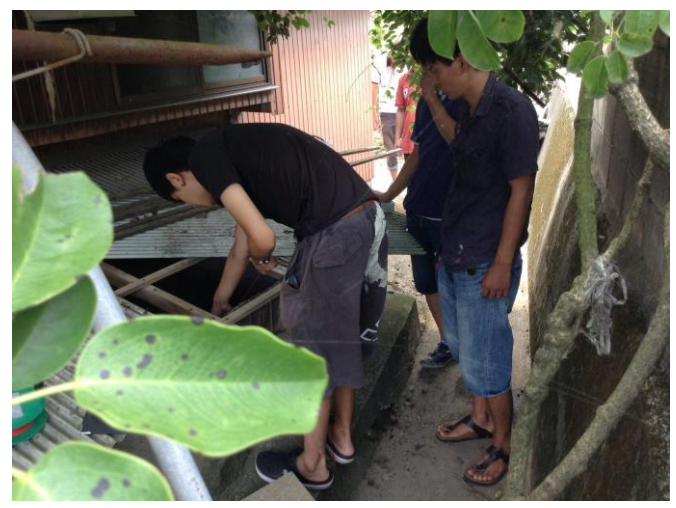
In situ field sampling at the Shimabara well.