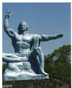
Nagasaki Peace Park