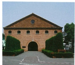
Mitsubishi Heavy Industries, Nagasaki Shipyard