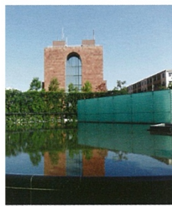
Nagasaki Atomic Bomb Museum