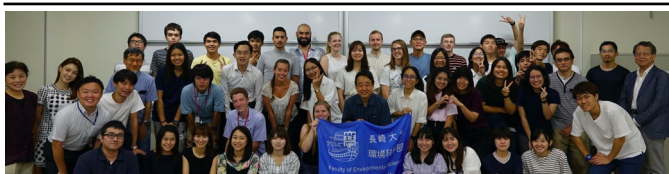
Participants of the Transdisciplinary Summer School on the Environment 2019

I have enjoyed participating in the summer school over these past two weeks. I think the opportunity for group discussion and making a group project was good for working on communication and teamwork skills. I also enjoyed learning about a number of topics in the lectures presented, as this gave a good overview of environmental issues. I hope to visit Japan again in the future!